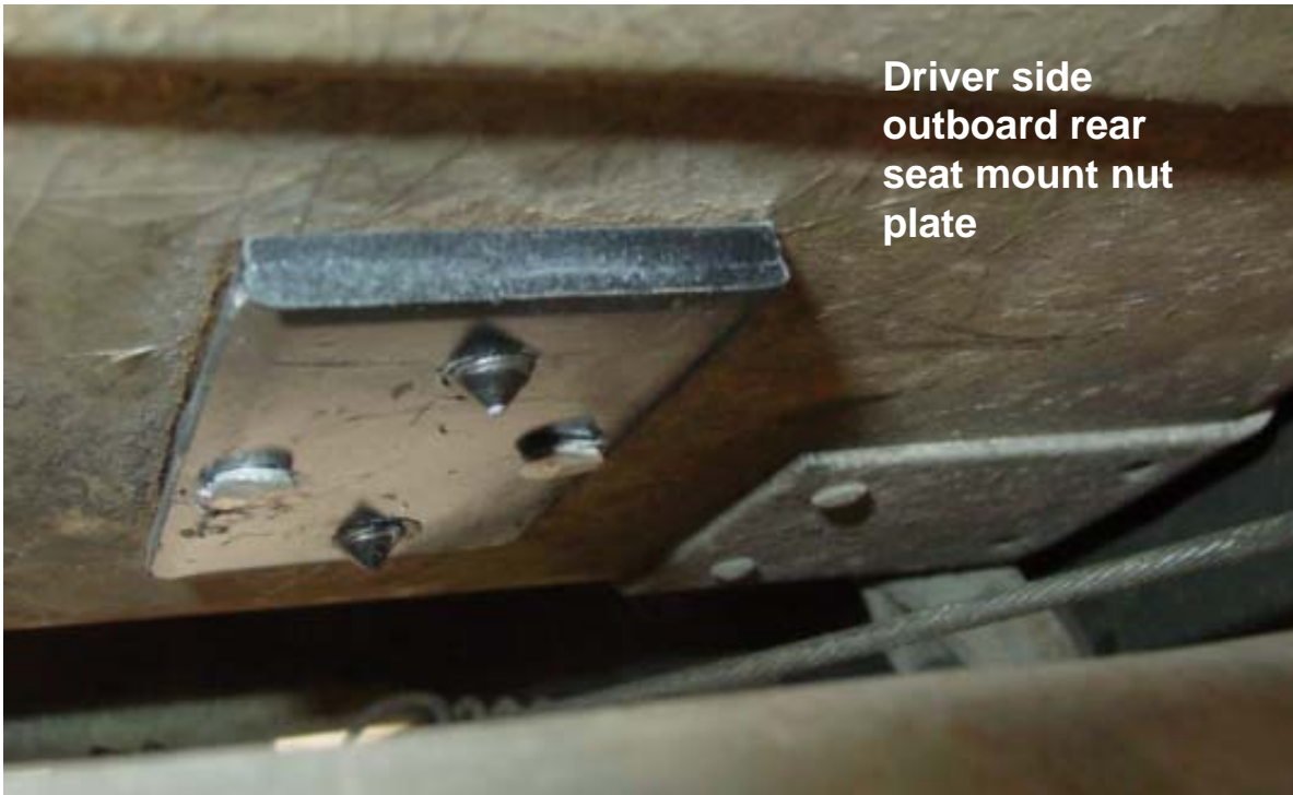
Driver side outboard rear seat mount nut plate

Rivets above flattened with a hammer. Rivet below set with an air hammer and concave rivet set. Some on the forum have made their own sets by drilling a “dimple” into the end of a steel rod using an appropriately sized drill.